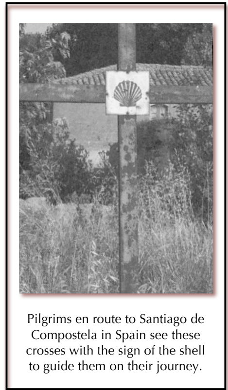
Pilgrims en route to Santiago de Compostela in Spain see these crosses with the sign of the shell to guide them on their journey.