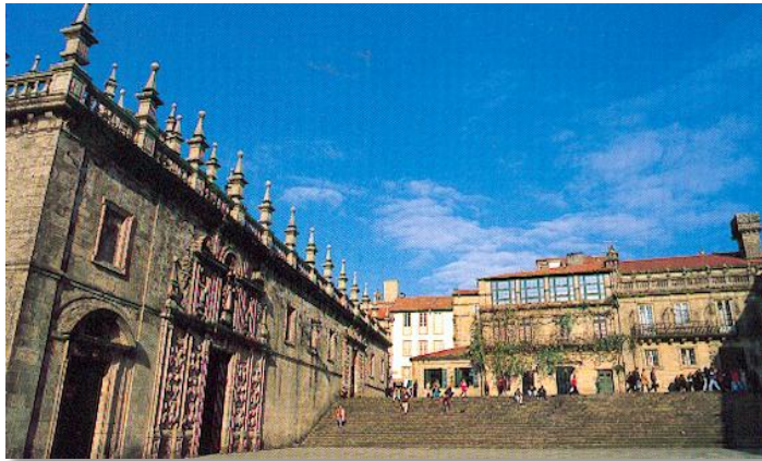
Santiago de Compostela

The Order of the Shell is only occasionally bestowed, and is intended only as a light-hearted thank you.